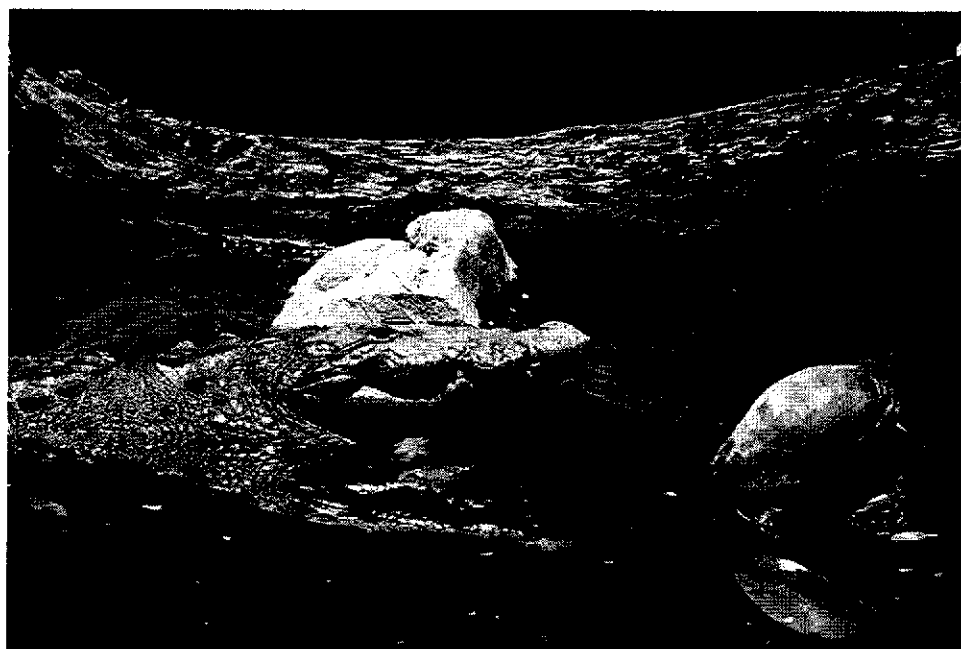
Crocodylus moreletii. male at Zoomat, Chiapas, Mexico.

EDITORIAL POLICY - The newsletter must contain interesting and timely information. All news on crocodilian conservation, research, management, captive propagation, trade, laws and regulations is welcome.. Information is usually published, as submitted, over the author's name and mailing address. The editors also extract material from correspondence or other sources and these items are attributed to the source. The information in the newsletter should be accurate, but time constraints prevent independent verification of every item. If inaccuracies do appear, please call them to the attention of the editors so that corrections can be published in later issues. The opinions expressed herein are those of the individuals identified and, unless specifically indicated as such, are not the opinions of the CSG, the SSC, or the IUCN-World Conservation Union.