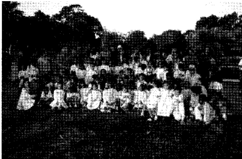
School children, teachers, CSG members, staff of the Cuban crocodile re-introduction project, local political leaders and residents, building community conservation, Isla de Juventud, Cuba.