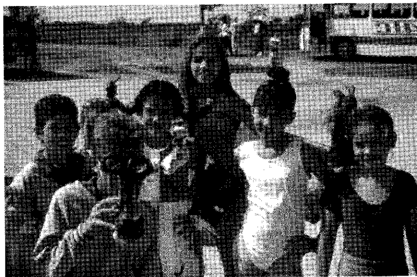
Childrens theatrical troupe, Crocodile Festival, Isla de Juventud. Swamp animals, a frog, a dove a butterfly and a Cuba crocodile are featured.

ISLE OF PINES CROCODILE WEEK FESTIVAL. The Cuban Crocodile Festival is a new event designed by the Cuban National Crocodile Program (Flora y Fauna), in conjunction with the